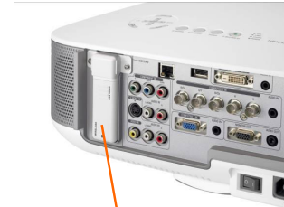
Optional Wireless LAN unit

Additionally, NP3250 takes advantage of Windows Network Projector functionality within Windows Vista via the wireless adapter or integrated LAN port (RJ45) without the need for additional proprietary software. User can make presentations from PC via the network without connecting RGB cable. USB connection for a mouse and keyboard allow desktop control when the projector is connected via Windows Remote Desktop via a wired/wireless network connection. No administrator rights are required to display the screen contents on a networked projector